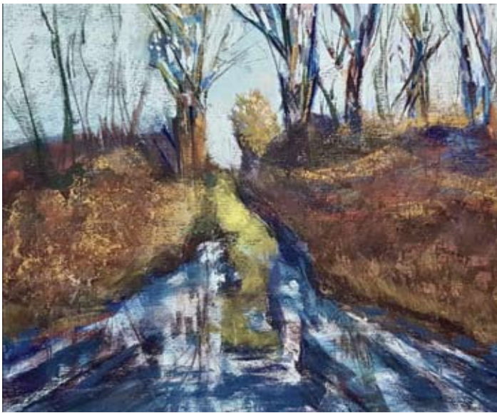
Bog road path by Janet Buell