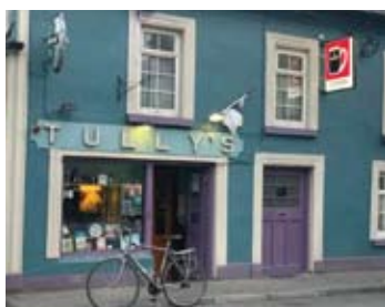
Tully's Bar and the Pier Head