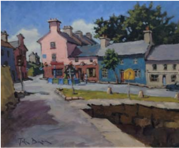
Kinvara