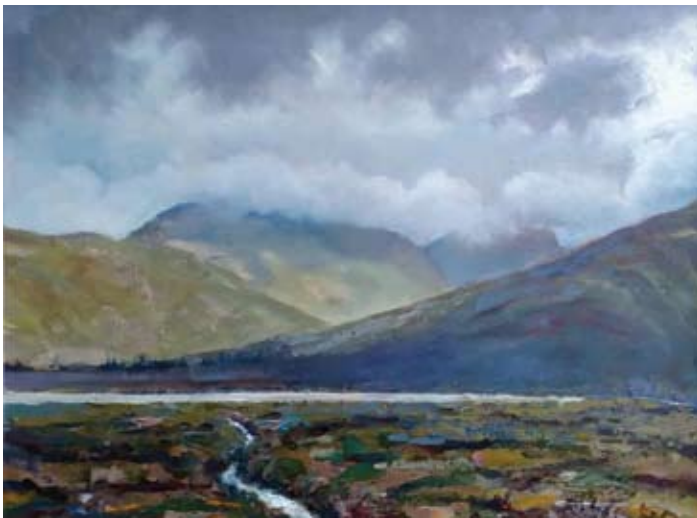
Connemara