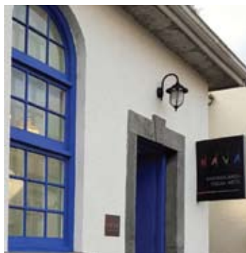
KAVA Courthouse Gallery