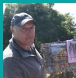
STEVE BROWNING Acrylics or Oil www.stevebrowning.net