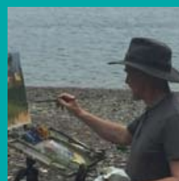
TONY ROBINSON Oil or acrylics www.tonyrobinsonart.com