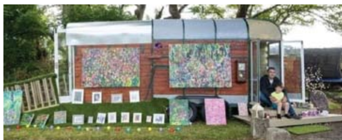
The Horsebox Gallery

There will be a group exhibition of Plein Air Art in KAVA Courthouse, after the weekend from Monday 3 June, for ten days. All participants in KPA24 are invited to submit a piece for the exhibition. Further details will follow to registered participants.