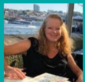
RÓISÍN CURÉ Watercolour www.roisincure.com