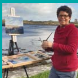
MAVIS GORMALLY Oil or acrylics www.mavisart.com